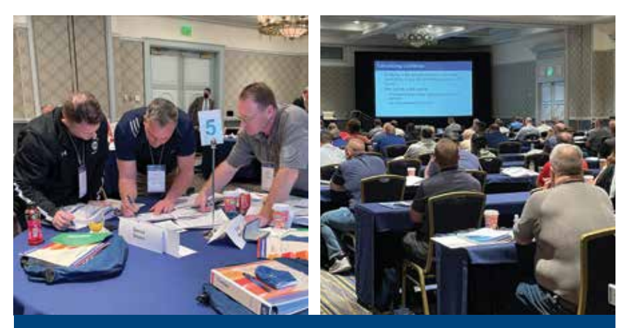
Register early—Seating is limited to 30 attendees.

After May 12, 2025 Member: $690 | Nonmember: $800